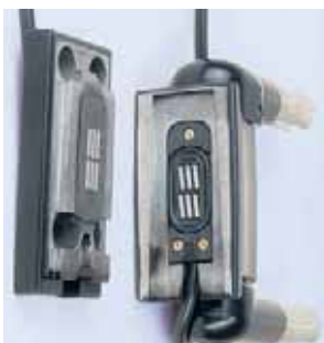
Direct contact system